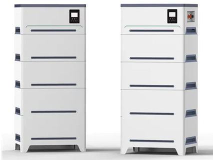
Reference and application Reference: 1000000000000000