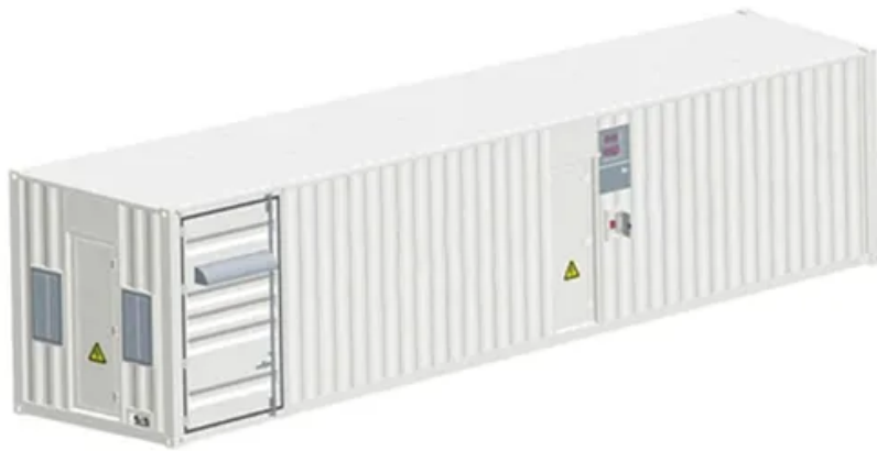
Photo voltaic solar panel companies