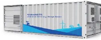
50KW modular power converter

So, in this tutorial, we will make the "PV Solar Inverter Circuit diagram." The inverter's function is to change the DC output the solar panels have collected into an AC. Please be aware that the various appliances or ...