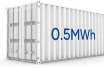
Standard 20ft containers

Gas turbines and combined-cycle power plants are making a significant contribution to reducing greenhouse gas emissions. Simply due to their efficiency, which is ...